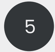
5 Year Warranty on fabric