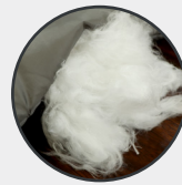
Nano trillium fiber